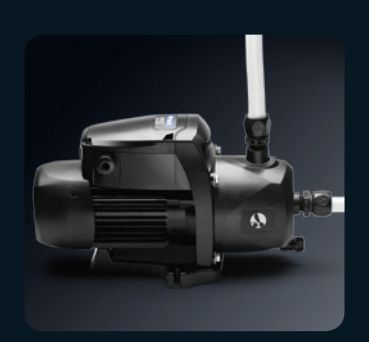
EASY INSTALLATION Includes Quick Connect fittings and easy access to wiring.