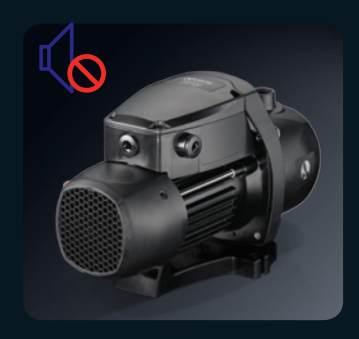
QUIETER OPERATION TEFC motor and innovative fan are designed for quieter operation.

ENERGY-EFFICIENT High-performance multistage pump reduces energy use by more than 30%*.