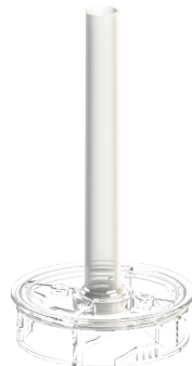
Snorkel and Eyeball Kit