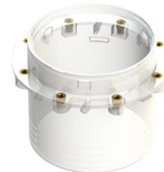
Plastic Parts Kit