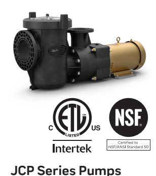
JCP Series Pumps

High-performance plastic pump with quiet, efficient operation. Easy retrofit for Pentair C Series®, CSP Series™ and EQ Series® pumps. Available with or without strainers in a variety of motor options.